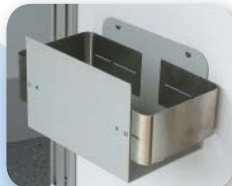
Foot Pedal Holder

CALL TODAY! For for pricing and details 1-888-639-5438 www.phswest.com