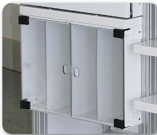
Clear plastic doors available for adjustable vertical and horizontal supply storage cabinets