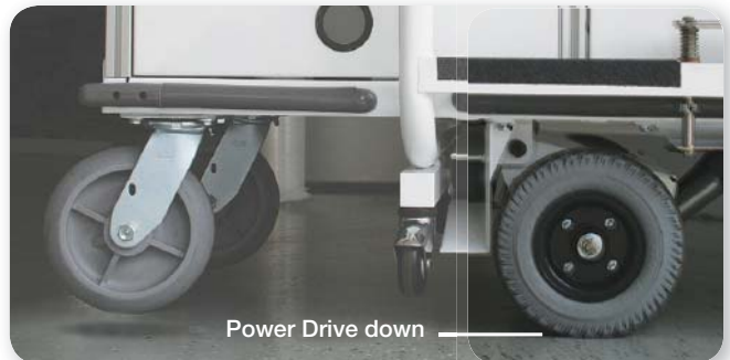
Retractable Drive provides flexibility to transport and position your motorized cart, with or without power