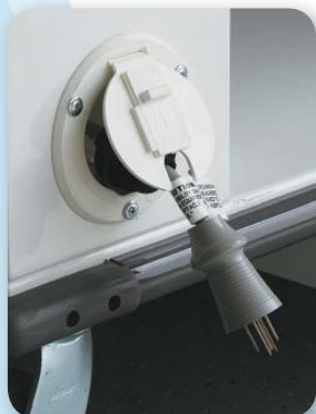
Power cord outlet