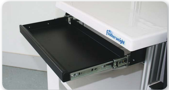
Slide out keyboard