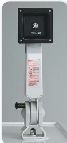
Adjustable Monitor Arm