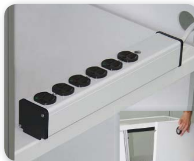
Six outlet power strip and easy access panel