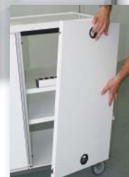
Power cord holder

CALL TODAY! For for pricing and details 1-888-639-5438