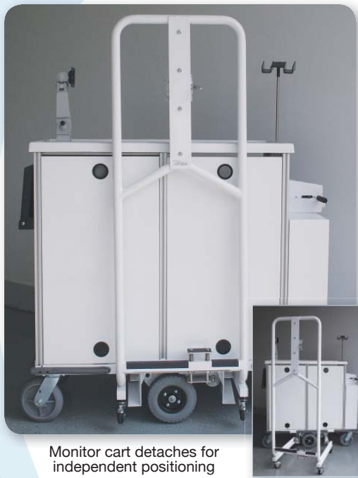
Monitor cart detaches for independent positioning