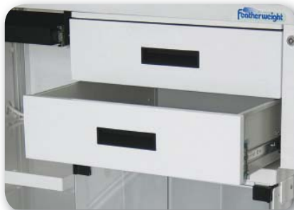
6 inch deep drawers, shown with key lock