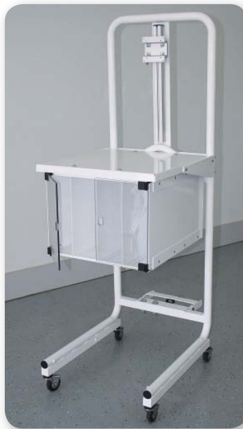
Monitor cart with storage