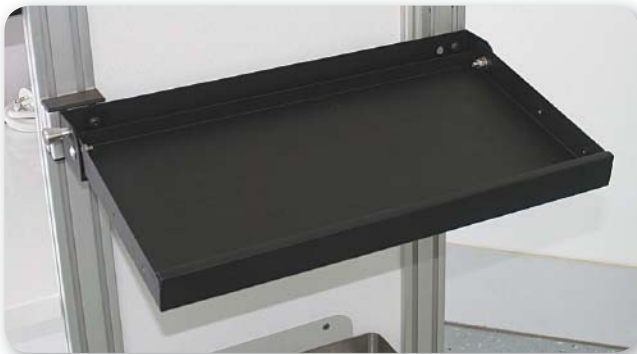
Flip-up, flip-down keyboard