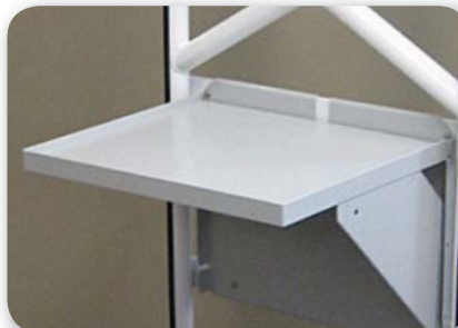
Fold-up work surface