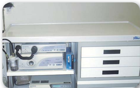
Seamless molded plastic work surface