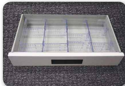
Adjustable drawer dividers Optional sizes: 6" and 4" drawers