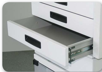
4 inch deep drawers