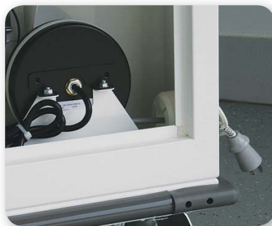
Retractable power cord