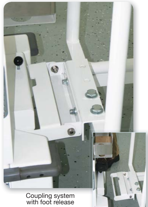
Coupling system with foot release