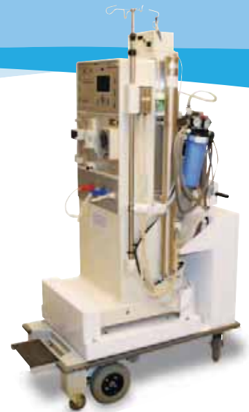
One-Piece Motorized Dialysis Workstations