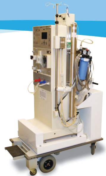
One-Piece Motorized Dialysis Cart